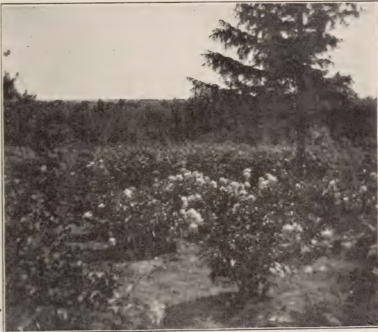
The cut between pages 26-27 shows a small bed of Paeonies on the grounds of Brand & Son taken after 40 dozen had been cut the same day. The view on this page was taken in 1899, Faribault, Minnesota.